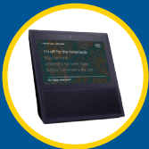
Amazon Echo Screen