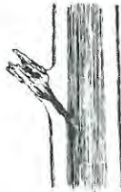
Leaving a stub provides open access to decay organisms.

Tree topping is the drastic removal, or cutting back, of large branches. It is intended to correct the problem of a tree outgrowing its space. Unfortunately, this action immediately creates large, open wounds that subject the tree to invasion by harmful insects and rot (decay). The reduction in leaf surface also causes damage to the root system, and reduces the tree’s ability to absorb the nutrients and water it needs for proper growth and development. The multiple branch wounds caused by topping provide open access to decay organisms that the tree cannot defend against. The health of the tree is started on a downward spiral that results in premature death of other limbs and branches. These can fall on your house, or your neighbor’s, or damage other personal property, resulting in liability claims against you. Ultimately, a topped tree dies long before its time, and may be more costly and dangerous to remove than a tree that dies from natural causes.