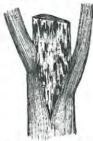
Shoots that grow below a topping cut are weakly attached and often become a hazard.

Topping should never be confused with proper pruning. A topped tree is easy to spot – the tree’s natural shape has been destroyed. A properly pruned tree looks as if no work has been done at all. With proper pruning, an arborist will carefully select and remove branches while maintaining the tree’s natural shape and beauty. Don’t be fooled into believing that you’re not getting your money’s worth if you don’t see a lot of branches lying on the ground when a trained arborist is working on your trees.